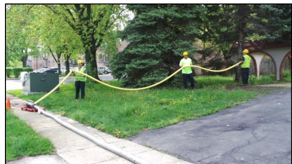
Figure 2. 38 foot lateral sock